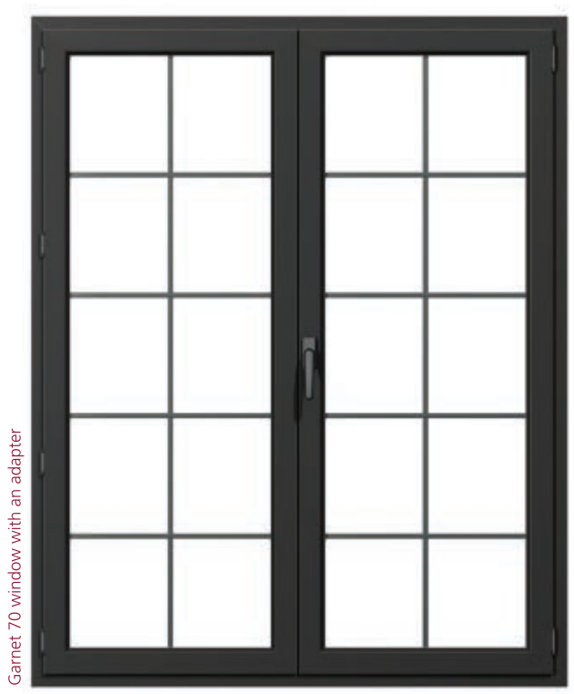
Garnet 70 window with an adapter