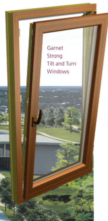
Garnet Strong Tilt and Turn Windows