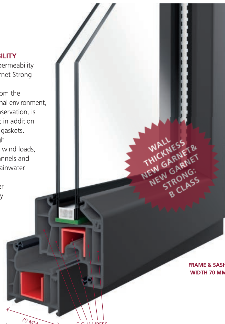
FRAME & SASH WIDTH 70 MM

Sound insulation up to 40 dB value can be provided with New Garnet and New Garnet Strong series. Therefore, it is possible to create a sound environment at a high quality life level even at the loudest places.